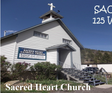
SACRED HEART CHURCH 125 Walsh St Wolf Creek, MT