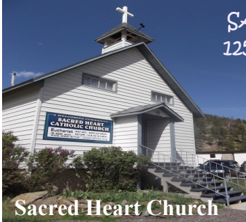
SACRED HEART CHURCH 125 Walsh St Wolf Creek, MT