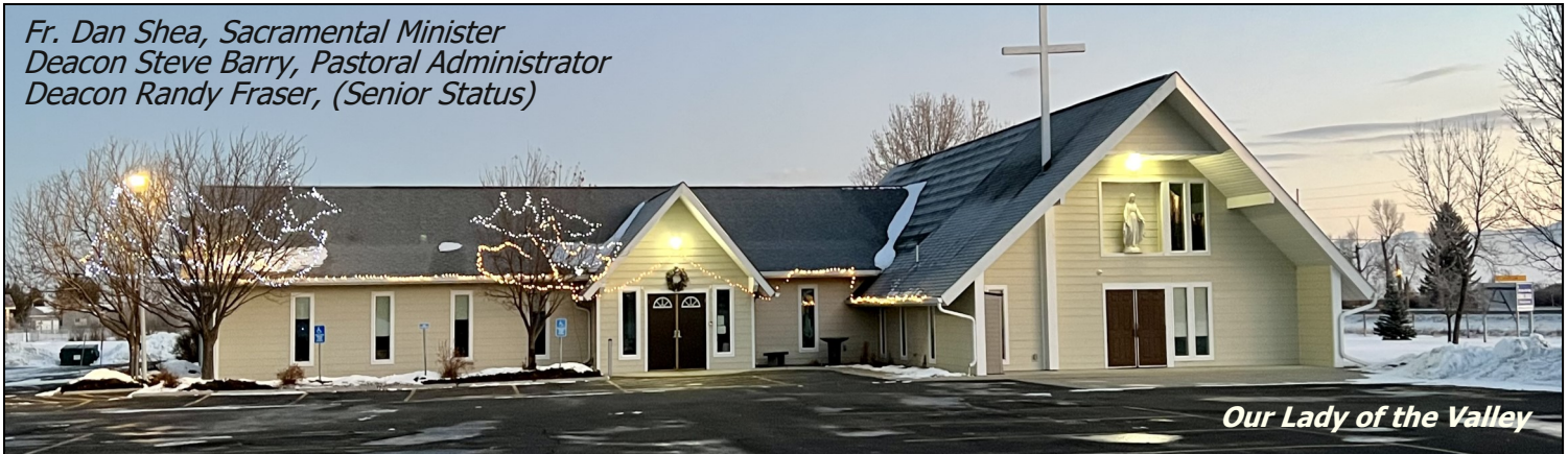
Our Lady of the Valley