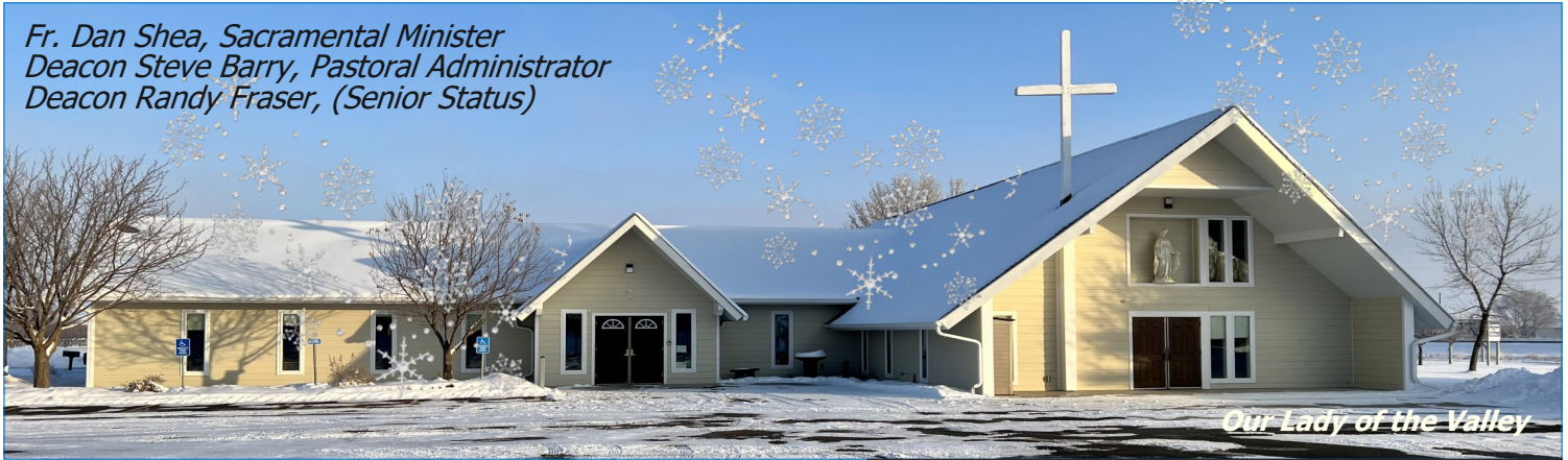
Our Lady of the Valley