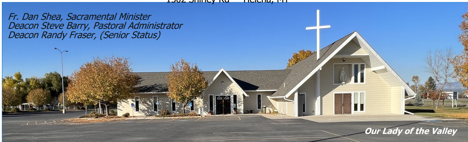
Our Lady of the Valley