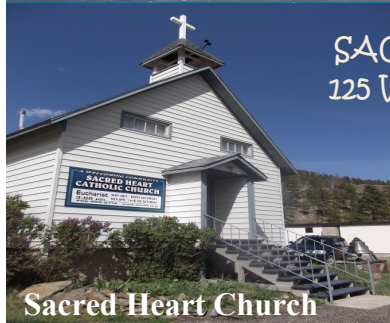
SACRED HEART CHURCH 125 Walsh St Wolf Creek, MT