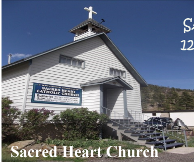
Sacred Heart Church

SACRED HEART CHURCH 125 Walsh St Wolf Creek, MT