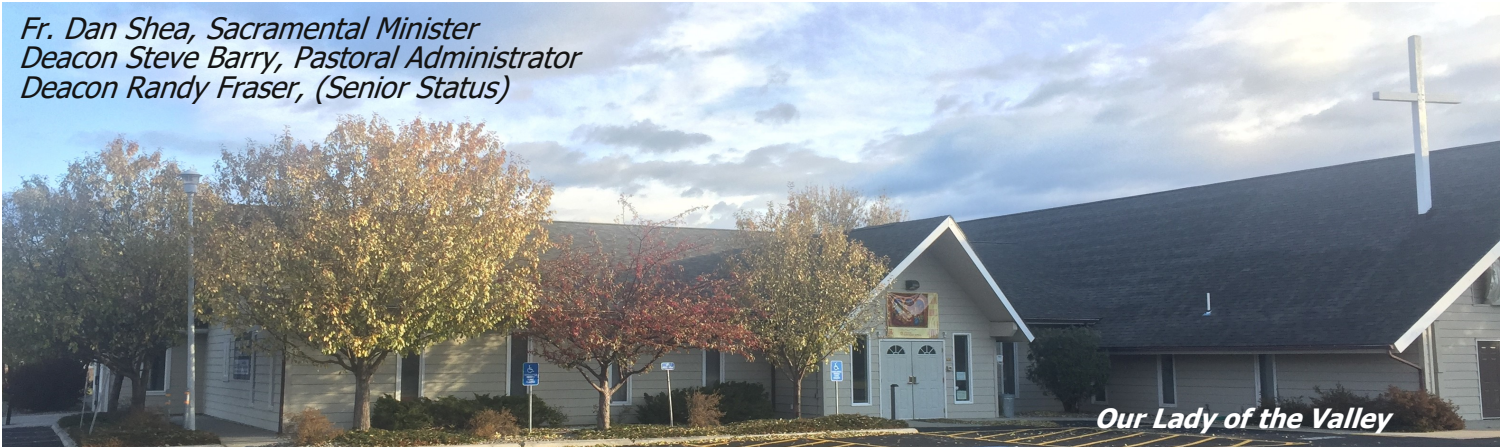
Our Lady of the Valley