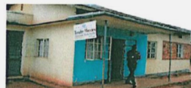
OUR FIRST HOME

When members visited Uganda they saw a small, squalid building, devoid of water, kitchen or bathroom where girls slept on the concrete floor in one room and boys in another. They promised to build them a home.