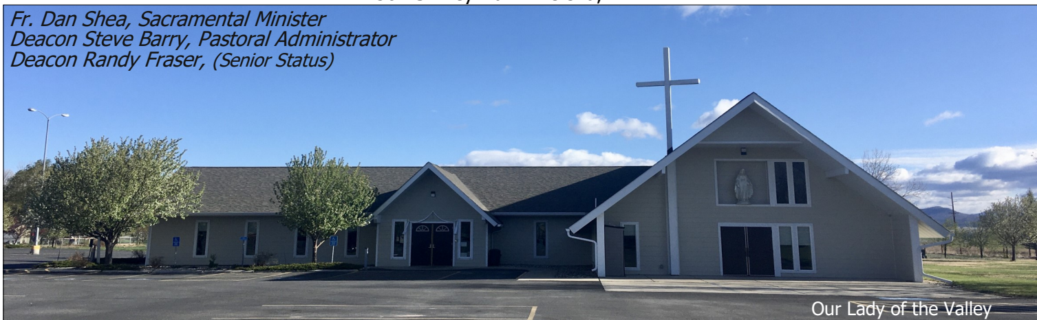
Our Lady of the Valley