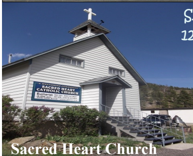
SACRED HEART CHURCH 125 Walsh St Wolf Creek, MT