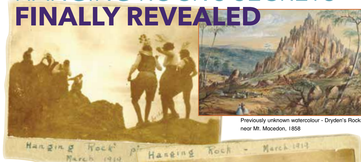
Hanging Rock March 1919. Clyde schoolgirls on the top of Hanging Rock soon after the school opened at Woodend on 10 March, 1919.