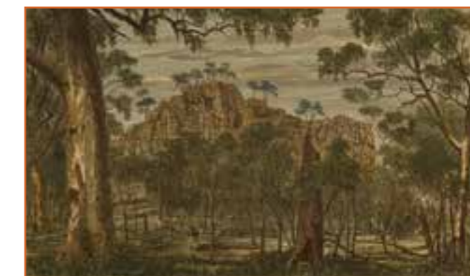
Dryden's Rock, Mount Macedon c. 1886. Artist unknown, engraving.

More information can be found at hangingrock.net.au . RRP $ 29.99, 264 pages, 146 illustrations.