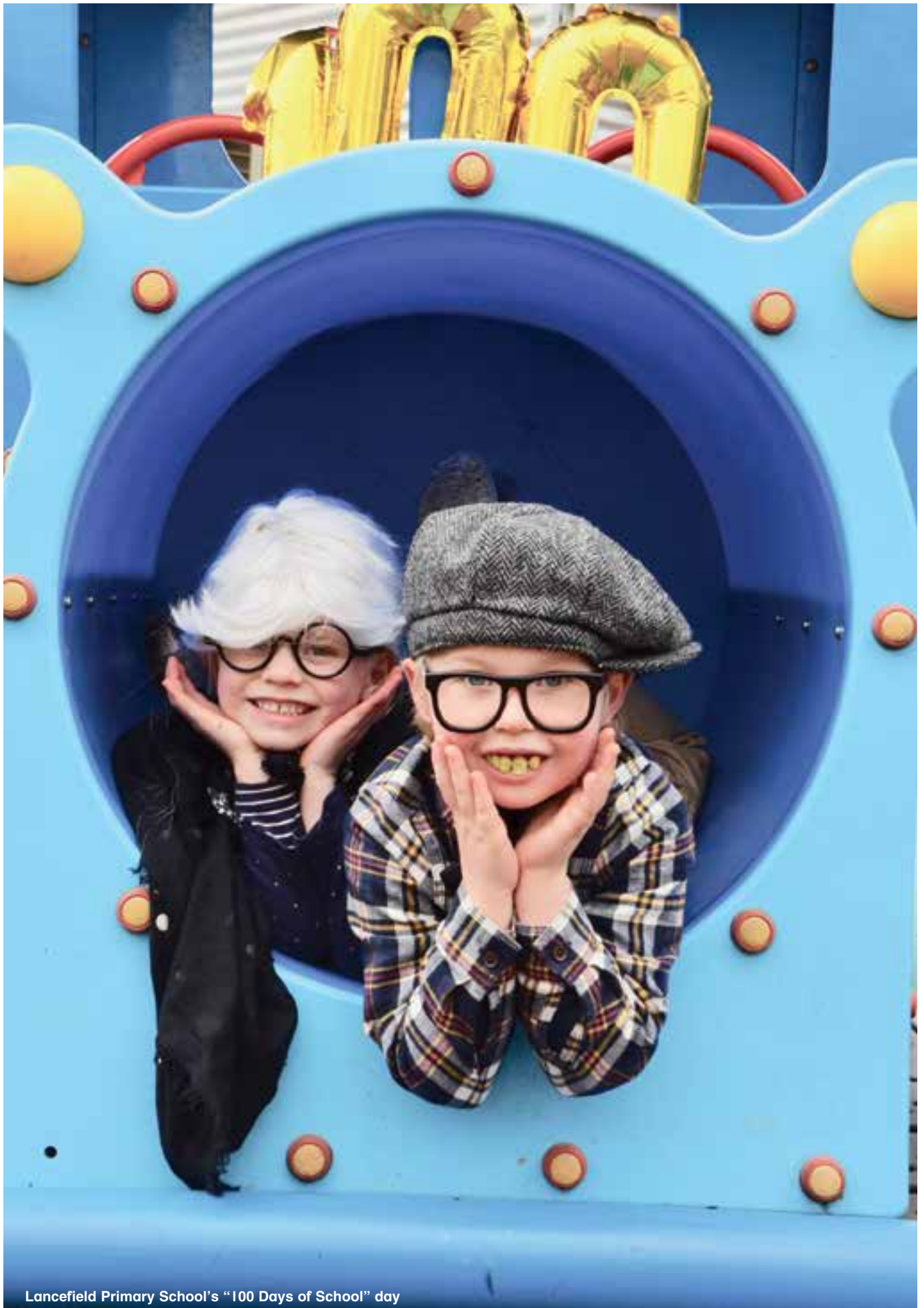
Lancefield Primary School's "100 Days of School" day