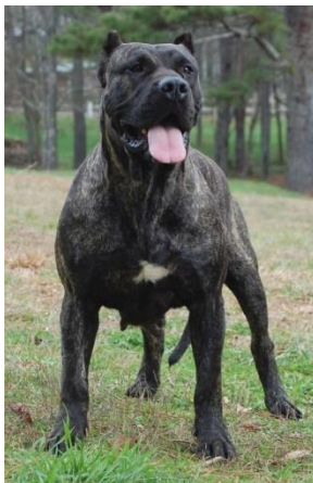
Perro De Presa Canario