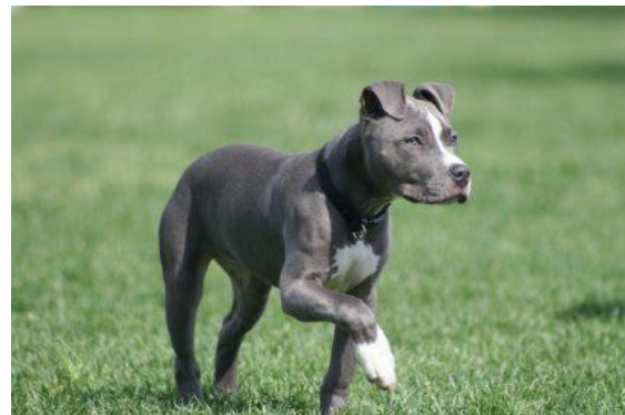
American Pitbull Terrier