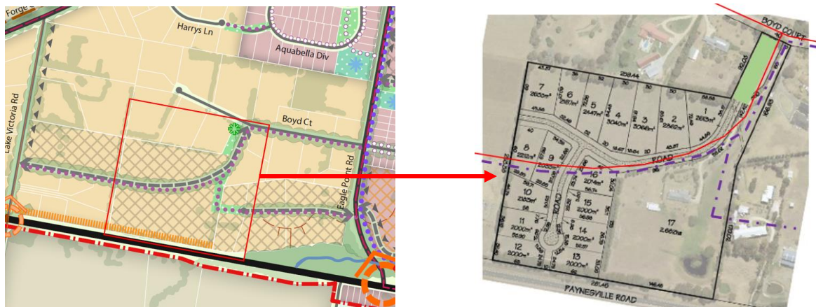
Fig. 6 – Eagle Point Structure Plan extract comparison with the proposed Plan of Subdivision

The graphic above (left) is an extract from the Eagle Point Structure Plan (May 2019) setting out the desired development pattern in the vicinity. The image above (right) shows the proposed plan of subdivision. The red line is an overlay of the road layout within the EPSP, dotted purple line is the pedestrian connectivity sought within the EPSP and the green shaded area is a planned 'pocket park'.