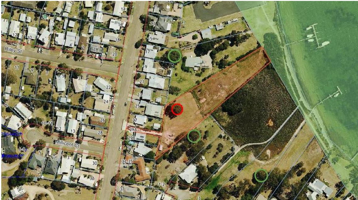
Figure 1: 29A Bay Road in neighbourhood context. Tree (red) subject to application. Trees (green) approximate location of comparative trees

In addition to being restricted by the LSIO, Council previously engaged with the landowner to provide drainage infrastructure on the land to service adjacent properties. The creation of easements over such infrastructure results in a further constrained building envelope. This information was revealed by the landowner through the application for development of a dwelling.