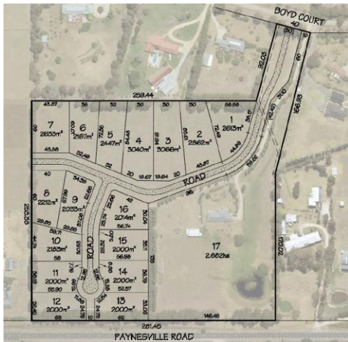
Fig. 4 – The proposed Plan of Subdivision