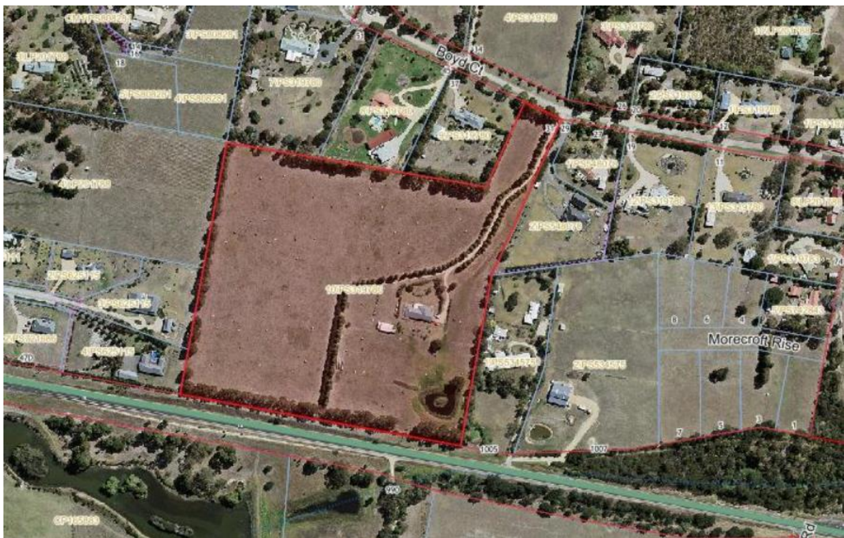
Fig.1 – The subject land

The application was referred to the CFA for comment in relation to bushfire risk. The CFA has responded with conditional consent.