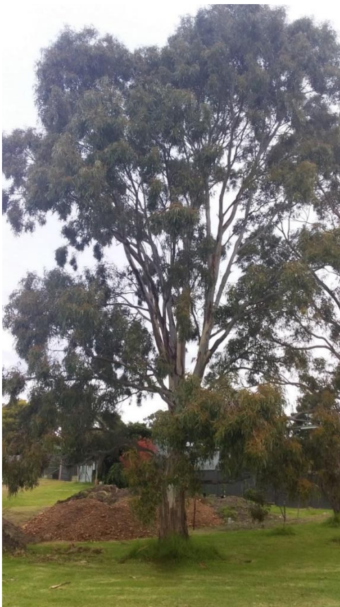
Figure 2: Subject tree, with fill material for dwelling in background (photo taken 21 May 2020 by officer)

In addition to being restricted by the LSIO, Council previously engaged with the landowner to provide drainage infrastructure on the land to service adjacent properties. The creation of easements over such infrastructure results in a further constrained building envelope. This information was revealed by the landowner through the application for development of a dwelling.