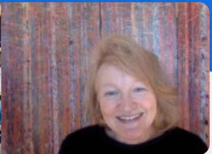
Krista Tippett & Miroslav Volf recording their podcast conversation / EPISODE 58 / Befriending Reality: Engaging Otherness with Hospitality, Artfulness, and Particularity at Depth (March 6, 2021)