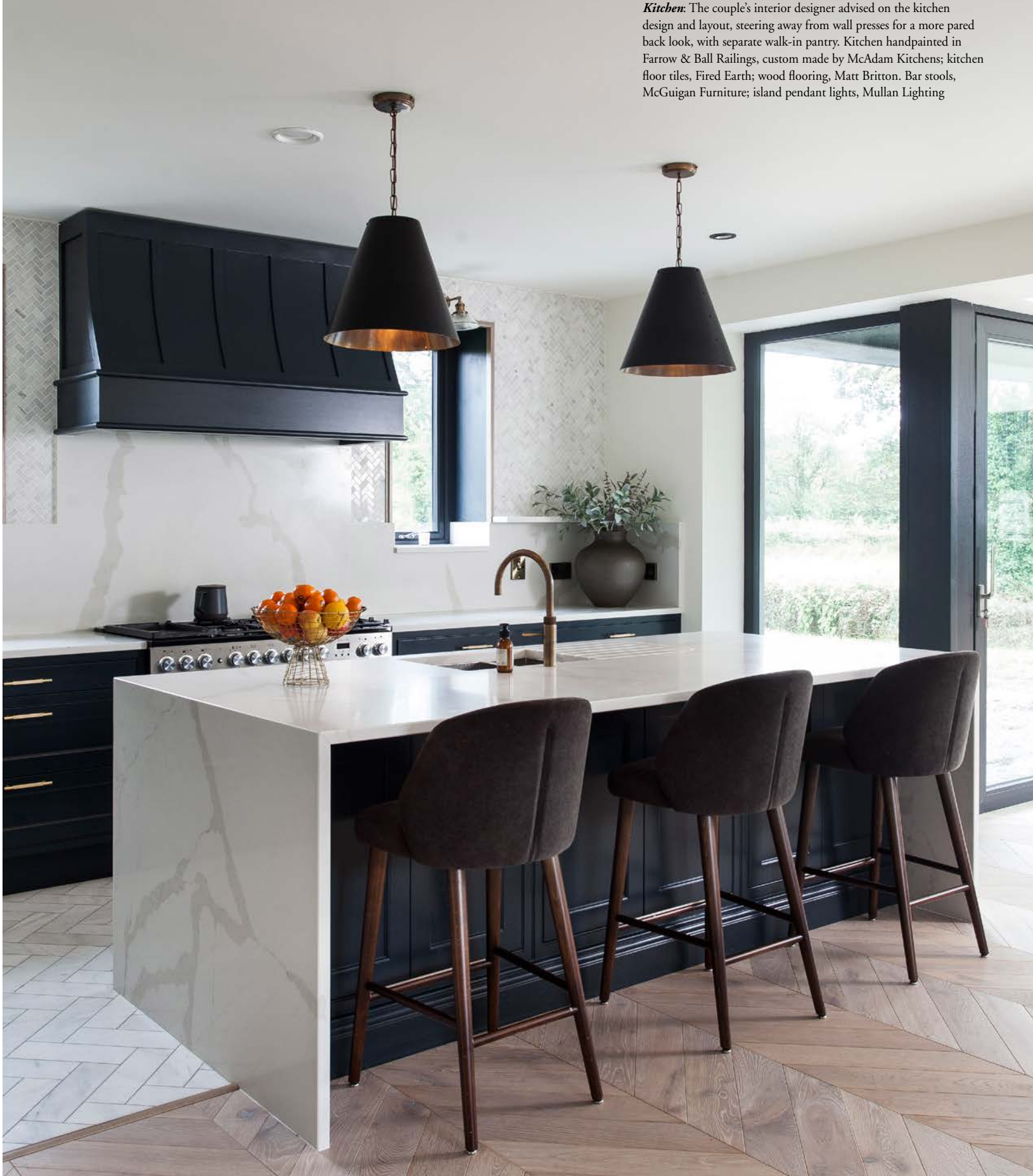
Kitchen: The couple's interior designer advised on the kitchen design and layout, steering away from wall presses for a more pared back look, with separate walk-in pantry. Kitchen handpainted in Farrow & Ball Railings, custom made by McAdam Kitchens; kitchen floor tiles, Fired Earth; wood flooring, Matt Britton. Bar stools, McGuigan Furniture; island pendant lights, Mullan Lighting