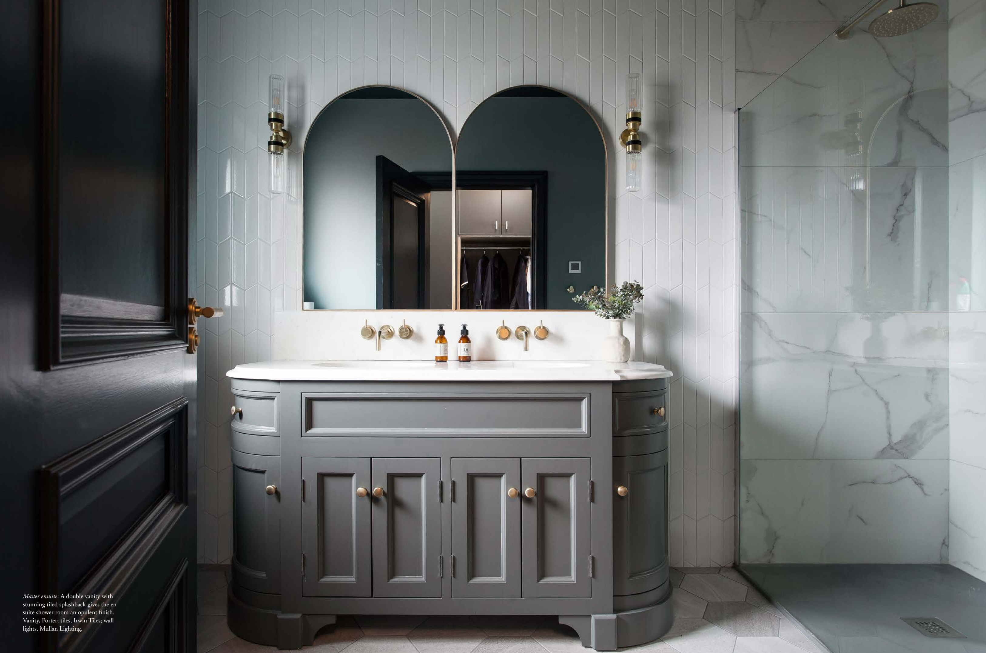
Master ensuite. A double vanity with stunning tiled splashback gives the ensuite shower room an opulent finish. Vanity, Porter; tiles, Irwin Tiles; wall lights, Mullan Lighting.