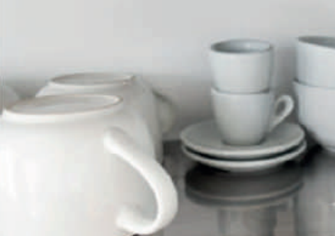
PORCELAIN – CERAMICS