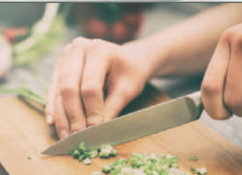
KNIFES – COOKING