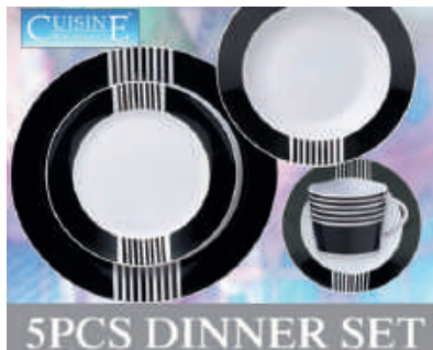
5PCS DINNER SET

'In our category Porcelain, we already made a lot of mugs, cups & saucers, pasta sets, chocolate fondue and we have the correct factories to produce and create Porcelain and Stonewares...!'