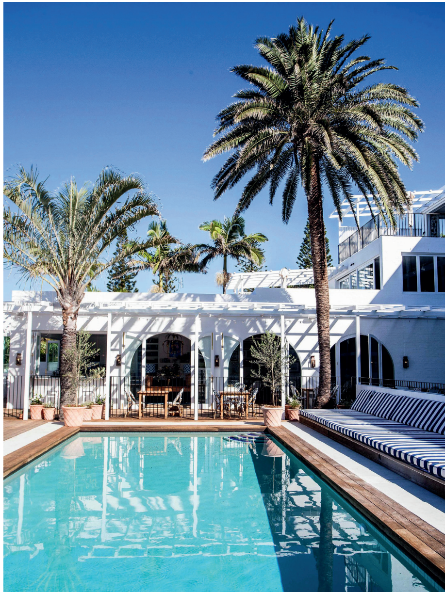
Above: the pool at Halcyon House, Cabarita Beach, Australia. Below: Emirates One&Only's Wolgan Valley resort in Australia's Greater Blue Mountains

✈ The mountains of the Gannan Tibetan autonomous prefecture, in CHINA 's remote Gansu Province, offer succour