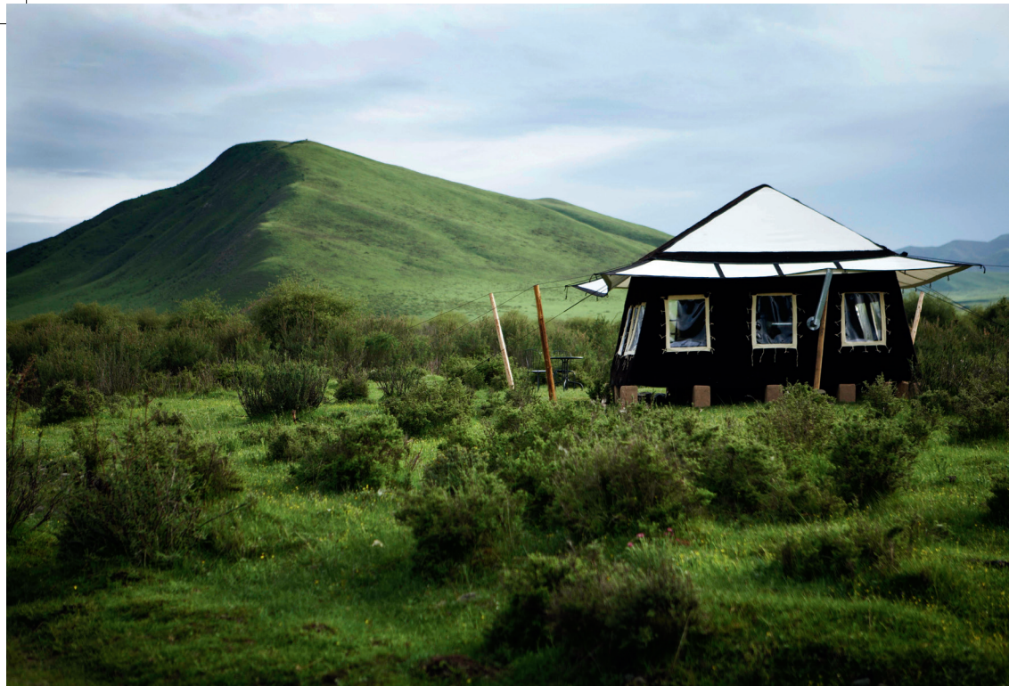
Above: a tent at Norden Camp in China's Gansu Province. Below: the open-air living room in one of the villas at Samujana, Koh Samui

(arguably the most important Tibetan Buddhist site outside Tibet itself), Norden marries sustainability bona fides – wood-burning stoves, solar power, bucket showers – with generous luxury hits. Besides the cloud-like European beds and Finnish sauna, guests benefit from the owners' other business: the production of cashmere-like khullu textiles from yak hair for fashion houses such as Lanvin and Céline. So while monastery tours, horse trekking and grassland yoga are all available, so are gorgeous shawls, blankets and accessories – sold under the brand name Norlha ( www.norlha.fr ) – in the camp's boutique.