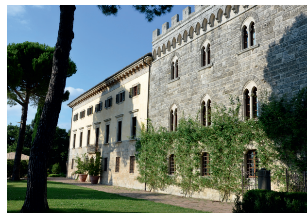
Above: the main villa at Borgo Pignano, Tuscany

➔ If an escape in the cypress-dotted landscapes of TUSCANY seems in order, Borgo Pignano ( www.borgopignano.com ; from €200) is one of the most bucolic. The main villa has 14 suites – with kilims layered over terracotta floors and velvet-clad slipper chairs next to claw-foot tubs in the bathrooms, they are the quintessence of boho chic. Farmhouses also dot the property – one sequestered in poplar groves, another overlooking a small lake – all equally appealing in their unfussy style. The proximity to Volterra, once an Etruscan stronghold and one of the region's loveliest hill towns, is one bonus; The English Patient -calibre views from almost every window are another. ♦