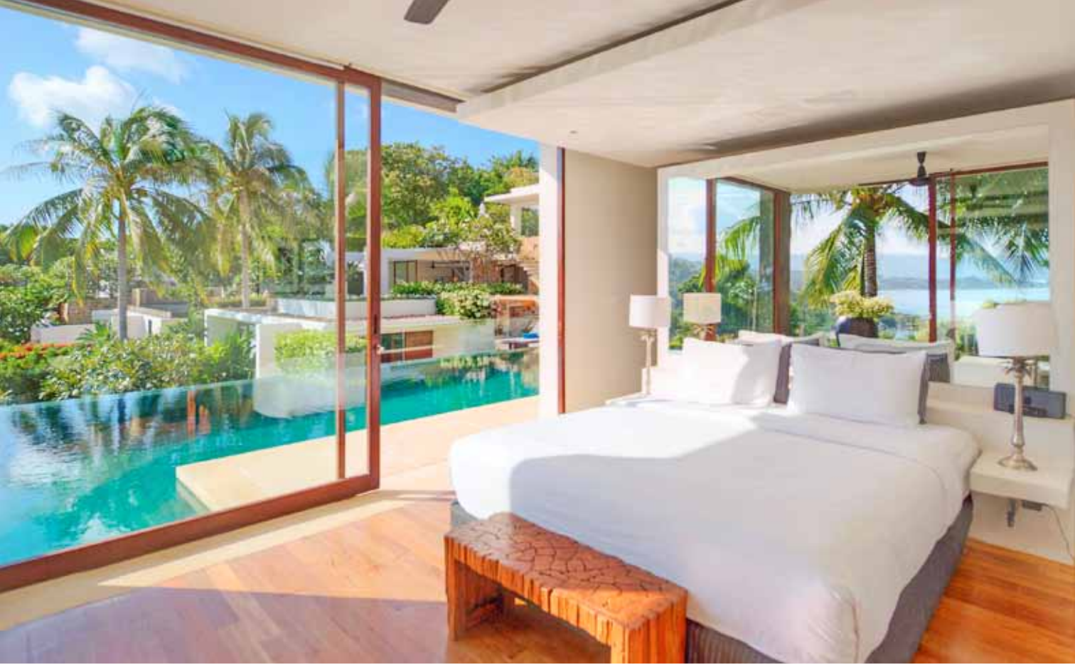
Conceived as an extension of the surrounding landscape, Samujana is made up of 27 villas, offering between one to eight bedrooms. Perched on a hillside overlooking a coral cove, the properties come with private beach access and an abundance of facilities and amenities.

AS THE THAI property market continues to power ahead, there has been a surge of property and hotel investment in Koh Samui over the past 18 months. Within the large luxury villa market on the island, Samujana has been a consistent top performer. The pre-eminent owner-managed gated estate has as an enviable international reputation for stunning villas with ocean views, award-winning architecture and five-star service. Since the first villa's completion in 2004, the 18-acre estate has become one of the leading tropical private villa estates in the world. Each villa has been designed by multi-award-winning architect Gary Fell, and boasts open living spaces that embrace the spectacular ocean view, while being sympathetic to the surrounding environment. Unlike other villa developments, each villa is bespoke yet maintains thematic elements of architectural composition to create a unique hillside estate masterpiece. Samujana's villas are beautifully equipped. Each has a private infinity pool looking out onto a stunning ocean view. Many have fully equipped gyms, private cinemas, barbecue terraces, and indoor spa treatment rooms. Villa owners have the option of offering their homes for rent year-round or for part of it through the management company's dedicated reservations and marketing division. The 27-villa development currently has four new homes listed for sale, starting at $3 million. Resale ▶