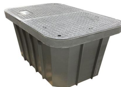
30" W x 48" L x 24"D Synertech Polymer Concrete Vault with the 30x48 Ultra-Lite Grey Cover installed.