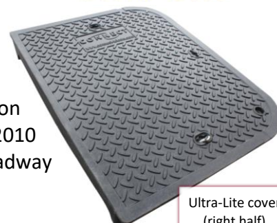
Ultra-Lite cover (right half)

The innovative material and structure offers over 50% weight reduction versus concrete. The Ultra-Lite covers conform to ANSI/SCTE 77 2010 Tier22 Class and is suitable for driveway, parking lot, and off-roadway applications subject to occasional non-deliberate vehicular traffic.