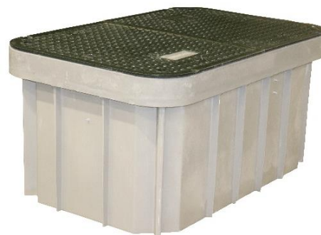
36" W x 60" L x 36"D Synertech Polymer Concrete Vault with the 36x60 Ultra-Lite Green Cover installed.

CONNECT telecommunications solutions inc.