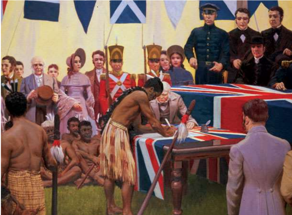
Te Tiriti o Waitangi