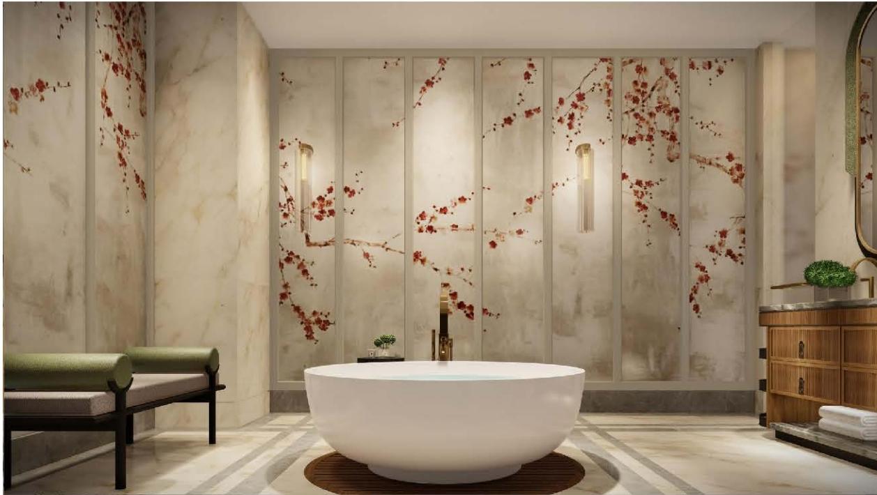
Villa bathroom, Solaire Hotel & Resort

However, one thing that is different is that the larger the project, the larger the team and therefore more people management is required, sometimes internationally across different time zones. Also, it's often the case that larger projects have more aggressive deadlines in order to achieve completion on multiple spaces simultaneously.