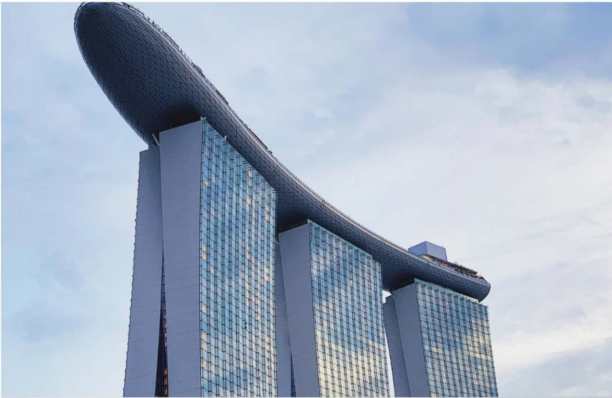
Marina Bay Sands, exterior