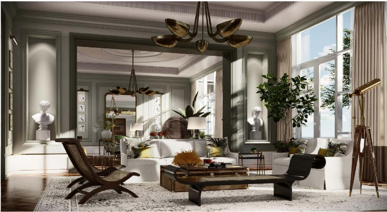
Villa Lounge, Solaire Hotel &amp; Resort