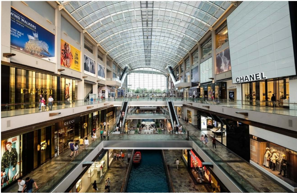
Marina Bay Sands, Retail Mall