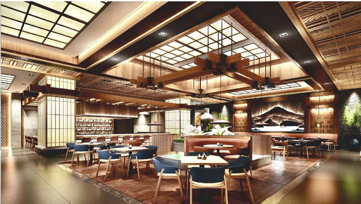
Solaire North Quezon City - Japanese Restaurant

Design is a means to problem solving. In a hospitality setting, this begins with understanding the customers', as well as the client's, needs and aspirations and from this developing a framework for concept development, innovation and creativity. Such an approach is as much linked to strategy as it is to aesthetics. Yes of course the look and feel are important but what matters even more is how the design makes guests feel. Are they at ease? Is their curiosity aroused while their sense of belonging is stimulated? Will the memories they take away with them convert family and friends into your next guests? Design has the power to evoke emotions, to change the way people experience a space and to encourage them to stay longer.