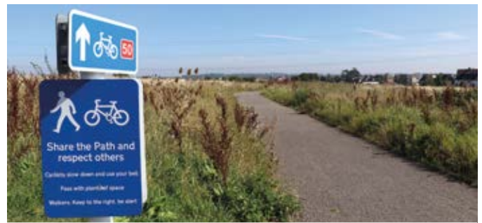
Platinum Way, Aylesbury