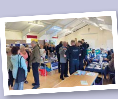
Left to right: Buckinghamshire Jobs and Apprenticeships Fair, Play Streets, Community Action Day