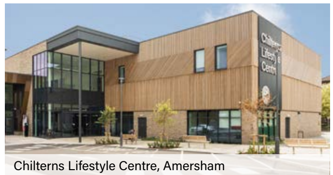
Chilterns Lifestyle Centre, Amersham