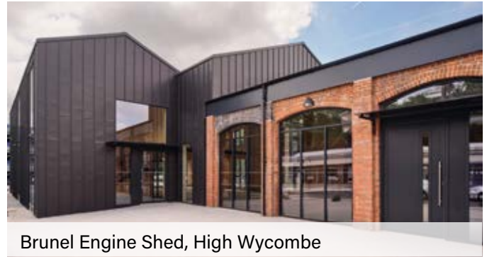
Brunel Engine Shed, High Wycombe