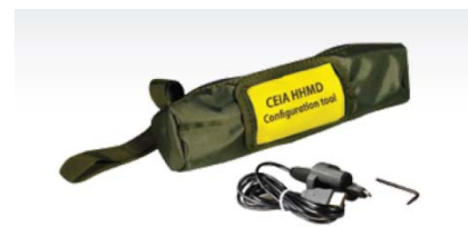
HHMD Configuration tool