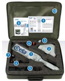
PD240 Set inside the carry bag