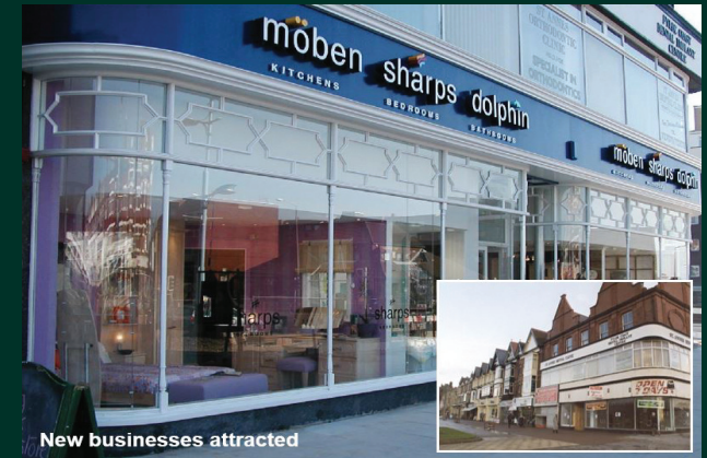
New businesses attracted