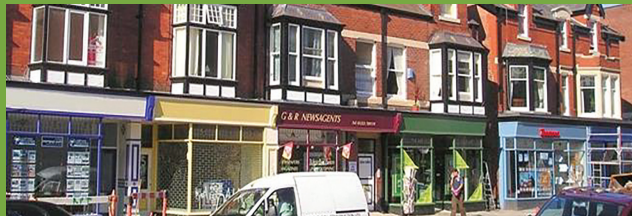
Example of shop front reinstatement with grant aid in St Anne's delivered by the Regeneration Team and the building owners

Please visit www.kirkhamfutures.org/shop-fronts-grants to register your interest and find out more about the scheme. If you are a tenant, please discuss this leaflet with your landlord. Once you have registered an interest, we will contact you with further information.