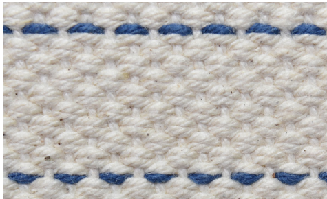
Top Cover View