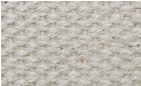
Bottom Cover View