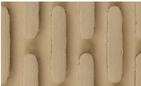
Top Cover View