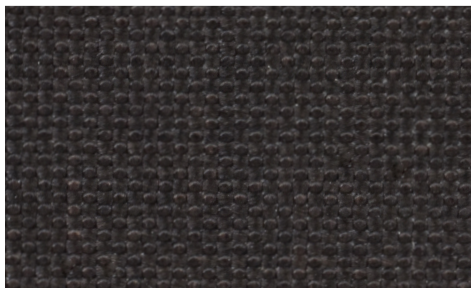
Bottom Cover View