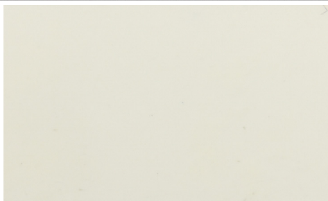
Bottom Cover View