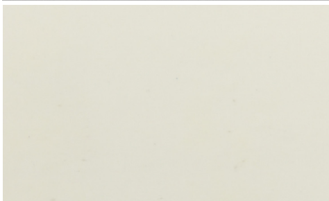
Top Cover View