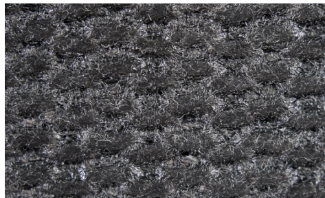
Bottom Cover View