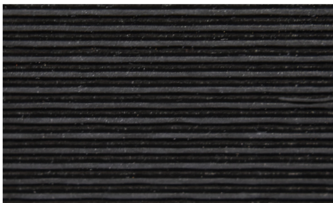
Top Cover View