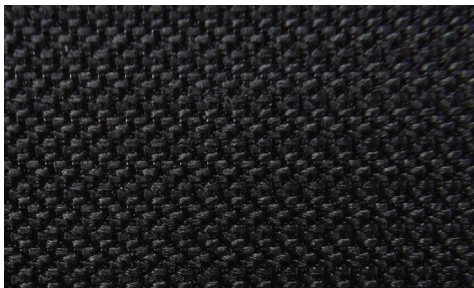
Top Cover View