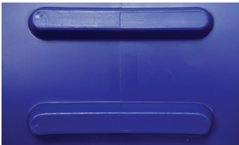
Top Cover View