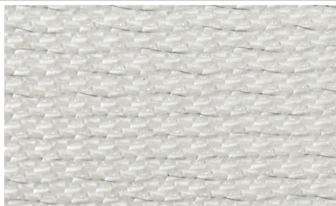
Bottom Cover View