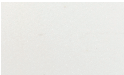
Top Cover View