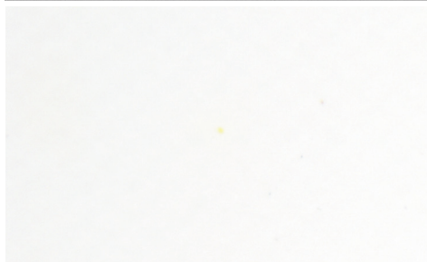
Top Cover View