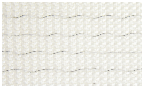
Bottom Cover View