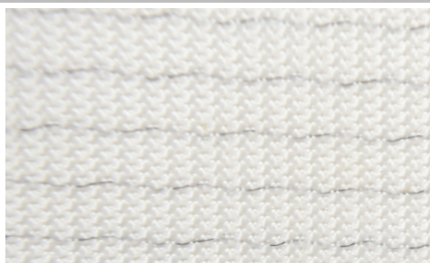
Bottom Cover View