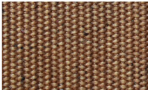
Bottom Cover View