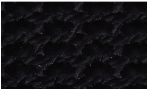
Top Cover View