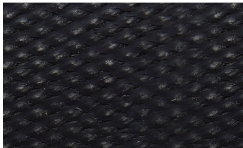
Bottom Cover View