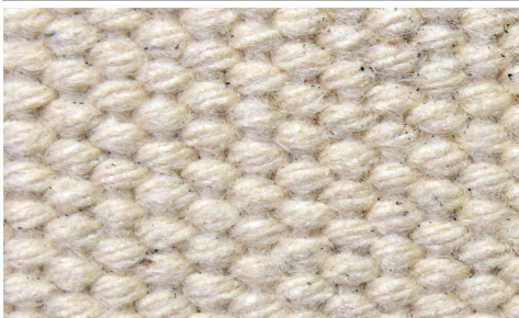
Top Cover View