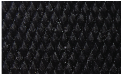
Bottom Cover View