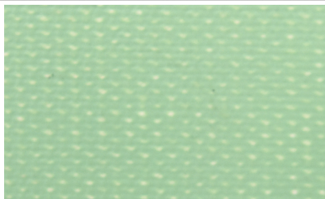
Bottom Cover View