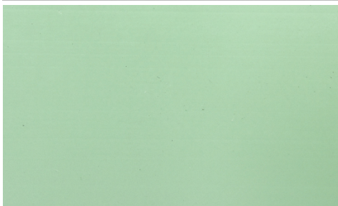
Top Cover View