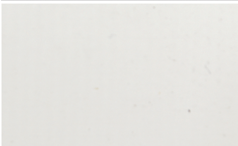
Top Cover View