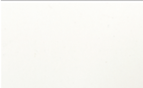
Top Cover View