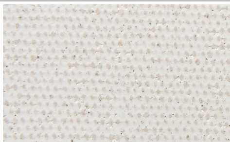
Bottom Cover View