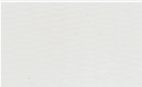
Top Cover View