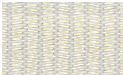
Bottom Cover View