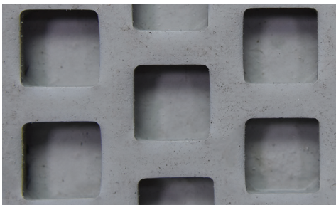
Top Cover View