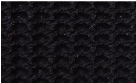
Top Cover View