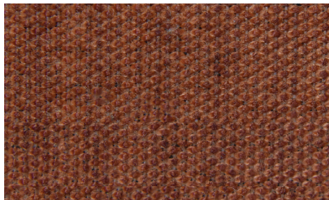
Bottom Cover View