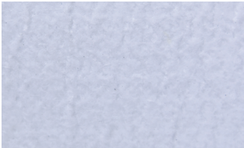
Bottom Cover View