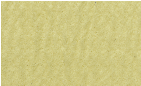
Top Cover View