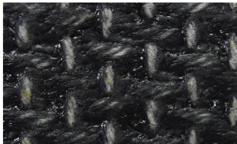
Bottom Cover View