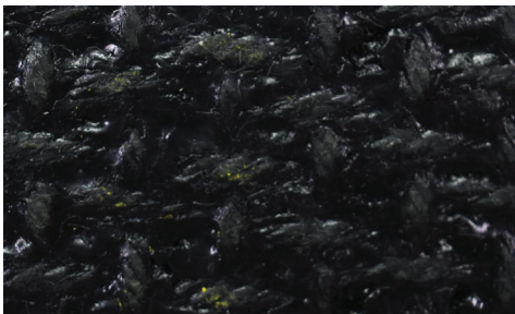
Top Cover View