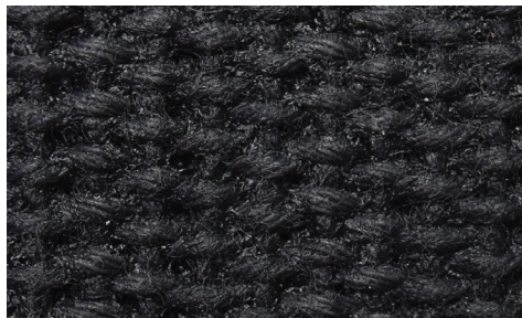
Bottom Cover View