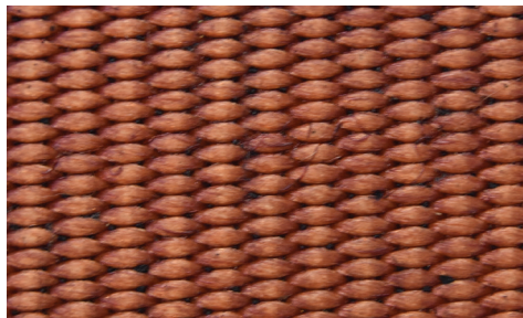
Bottom Cover View