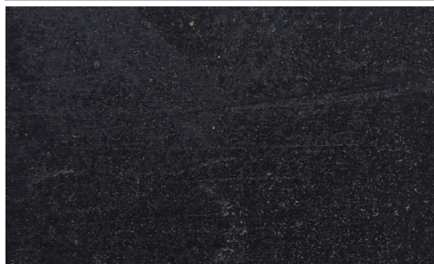
Top Cover View