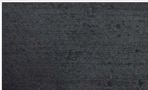
Bottom Cover View