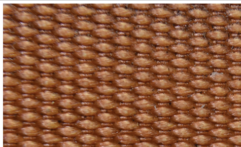
Bottom Cover View