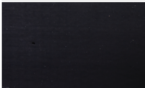
Top Cover View