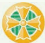
ST BRIGID'S COLLEGE Lesmurdie, WA 1929