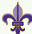
ST ALOYSIUS COLLEGE Adelaide, SA 1880