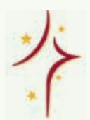
MERCY REGIONAL COLLEGE Camperdown, VIC 1973 Affiliated School