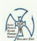
ST FRANCIS XAVIER PRIMARY SCHOOL Ballarat East, VIC 1914 Affiliated School